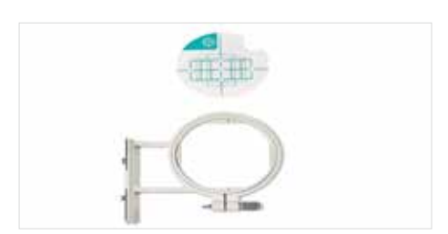
Embroidery frame "S"

Advance your skills with our embroidery design software, which offers powerful features to suit both beginners and professionals alike.