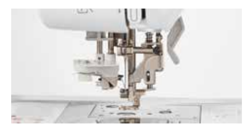
Advanced needle threading system