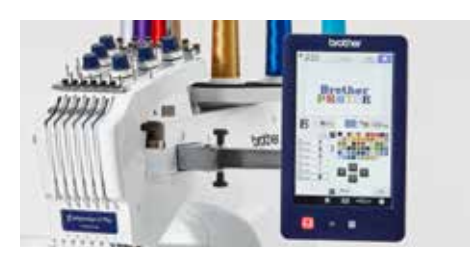
Customise designs on screen

Convert multi-colour designs to single-colour embroidery. Also benefit from registration marks for easy, continuous borders.