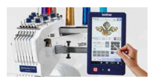
10.1" high-resolution IPS LCD touch screen Preview your designs with this HD touch screen,

Easily embroider hard to reach items such as caps, tote bags, sleeves, trouser legs and much more.