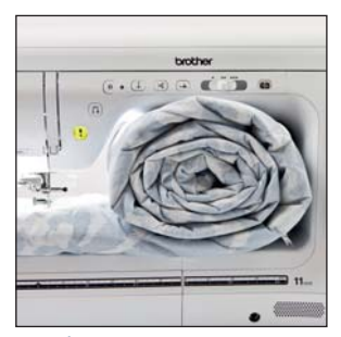
11<sup>1</sup>/4" extra-large sewing space