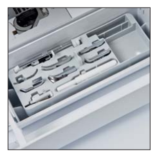
Handy accessory compartment

Includes multi-directional feed to sew straight in eight directions and in four directions with zig zag.