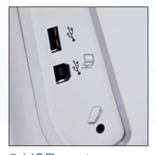
2 USB ports

Free up your hands using this knee lift to raise/lower the presser foot. Ideal when working on larger projects such as quilts.