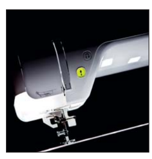
Ultra-bright feature lighting

The ultra-bright LED lighting gives a crisp, bright natural light, so you can see colours and stitch details, no matter what your lighting conditions. The lighting brightness is fully adjustable, so you can set it at a level to suit you and your environment.