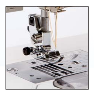
Automatic electronic needle threading

The ultra-bright LED lighting gives a crisp, bright natural light, so you can see colours and stitch details, no matter what your lighting conditions. The lighting brightness is fully adjustable, so you can set it at a level to suit you and your environment.