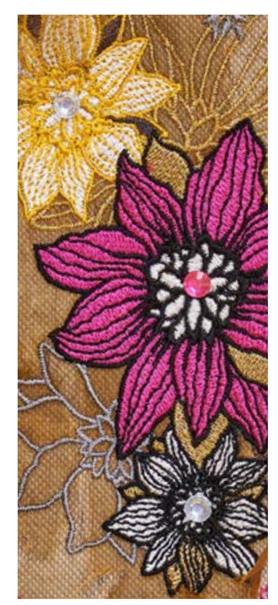
*magnetic hoop sold separately