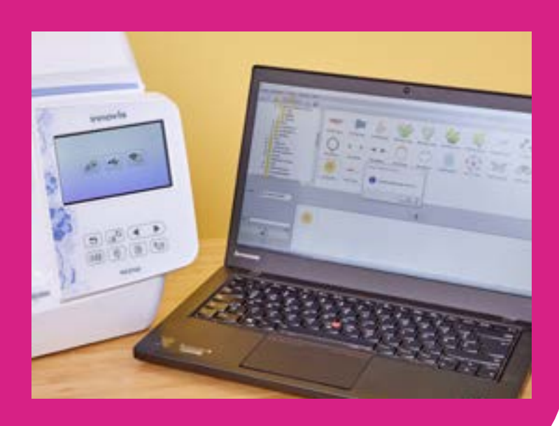
*Compatible with Windows desktop devices only.

You can also add more designs via the built-in USB port.