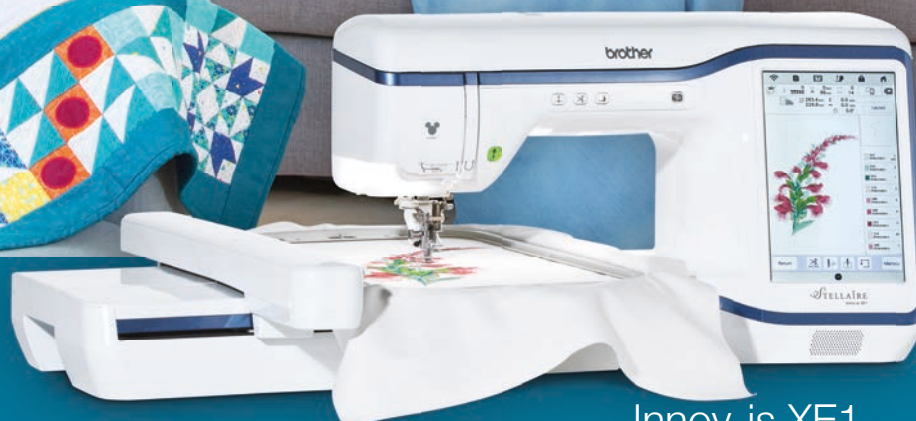
Innov-is XE1 embroidery machine