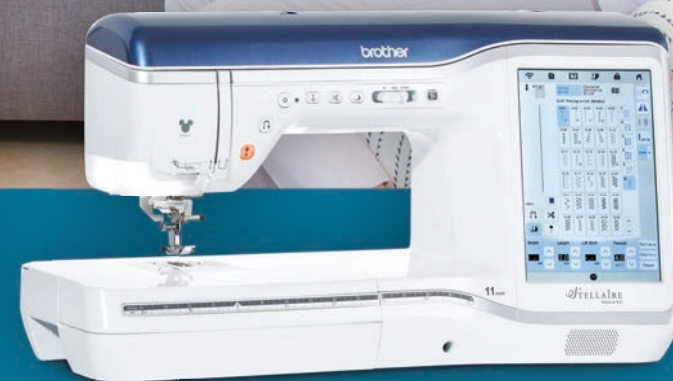
Innov-is XJ1 sewing & embroidery machine